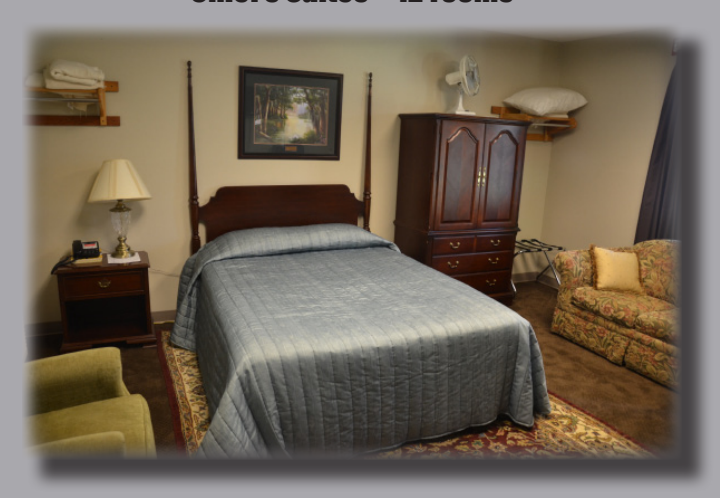
Standard Rooms – 300+(Approx.)