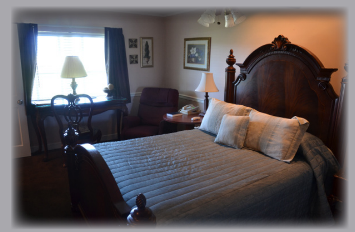
Distinguished Visitor/VIP - 3 rooms

Whatever the purpose of your stay may be, the Combact Readiness Training Center is able to accommadate your needs. CRTC offers a variety of rooms which include full maid service. Wireless internet is availabe in each room as well. All rooms have cable, flat screen television, microwave and refrigerator.