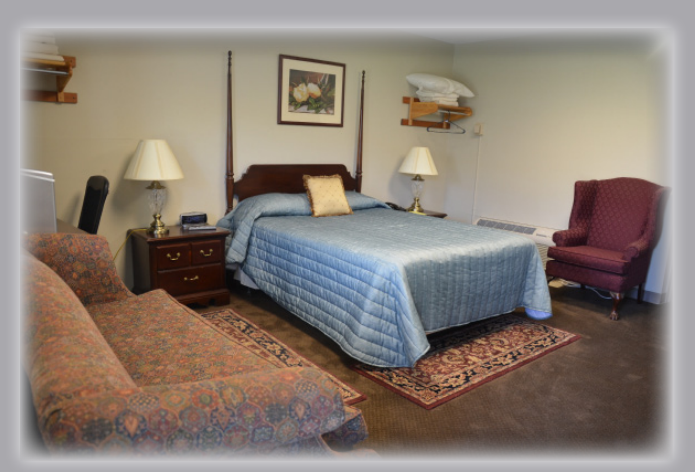
Distinguished Visitor – 18 rooms